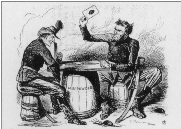
This pro-Confederacy cartoon appeared in the British magazine Punch during the Civil War, depicting a fierce Abraham Lincoln playing his "last card"—the Emancipation Proclamation—in a desperate effort to beat his rival, Jefferson Davis.

Diplomacy proved challenging for all sides in the American crisis. The fragile balance of power on the Continent and in the empires centered there limited the range of movement of even the most powerful nations. The Confederacy's diplomatic strategy depended on gaining recognition from Great Britain and France, using cotton as a sort of blackmail, but European manufacturers had stockpiled large supplies of cotton in anticipation of the American war. British cartoonists, sympathetic to the Confederacy, ridiculed Abraham Lincoln at every opportunity, portraying him as an inept bumpkin—until his assassination, when Lincoln suddenly became sainted. Overall, the North benefited